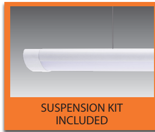
SUSPENSION KIT INCLUDED