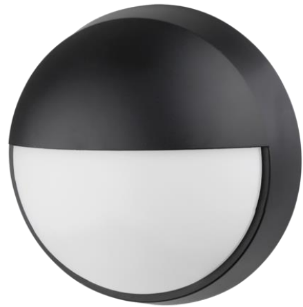
Black Oval Bulkhead with Plain & Eyelid Fascia